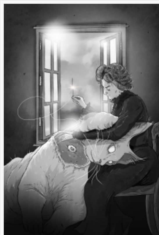
A sample photo from the story, "The Cat Who Wanted to Eat the World" from the book "Fifteen Pounds of Muscle and Bounce." Illustration by C.S. Fritz.

This press release can be viewed online at: https://www.einpresswire.com/article/535700478