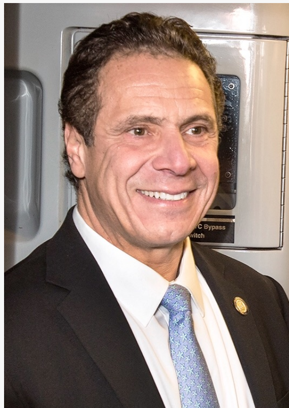
Andrew M. Cuomo, 56th Governor of the New York State