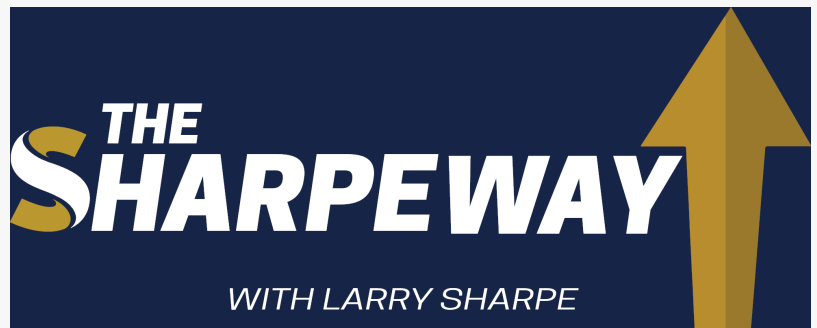
The Sharpe Way Show

This press release can be viewed online at: https://www.einpresswire.com/article/535708726