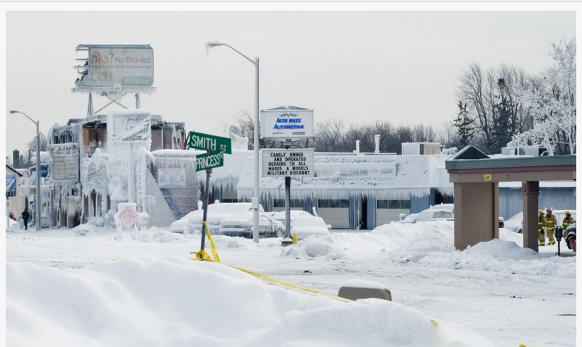
Iced Away

Texas is recovering from their worst and largest power failure in history. Their grid was vulnerable because of neglect and a lack of accountability. New York has many of the same problems. Not only is nothing being done, the current administration is undermining efforts to take proactive action and putting lives at risk.