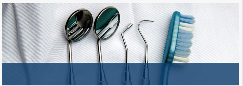
All Valley Dental: Custom DENTURE and BRIDGE Repair