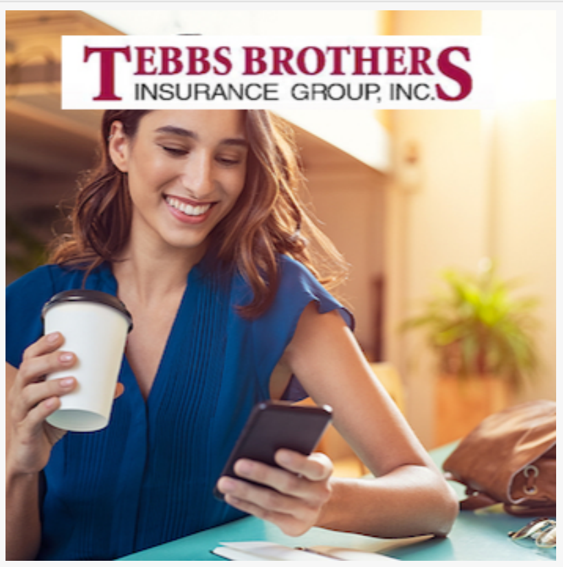
TEBBS Bros: UTAH's #1 BUSINESS Home Life Auto INS

Since policies vary with protection options, it's important to talk to a specialist at Tebbs Brothers Insurance Group, Inc. to create a policy that insures your needs. If you are involved in an accident without car insurance, you're looking at high out-of-pocket