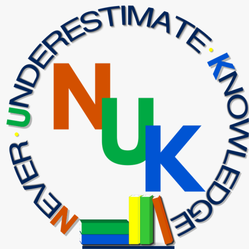
Never Underestimate Knowledge (NUK) Logo