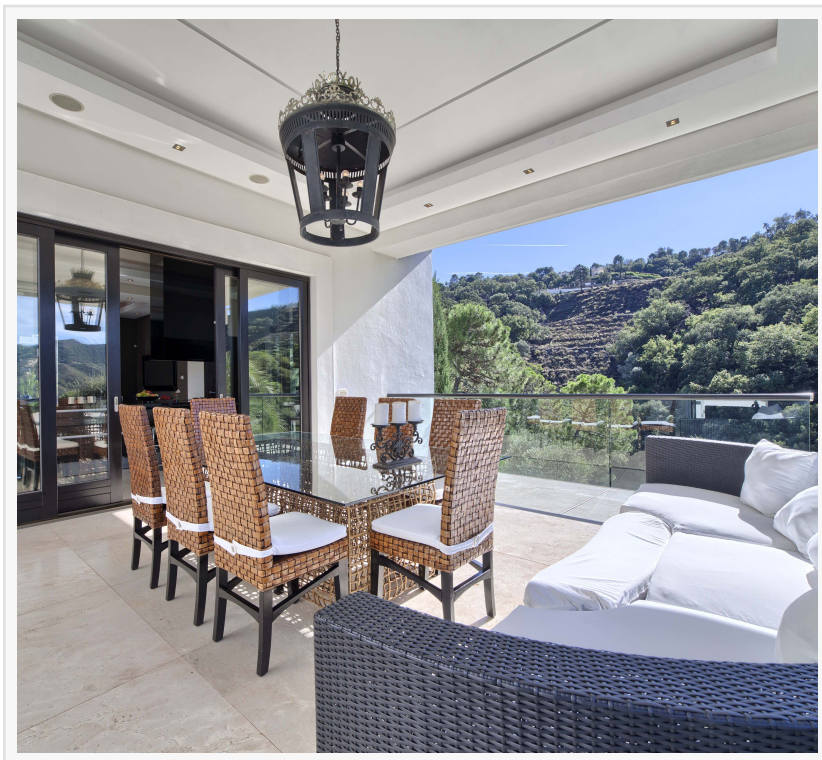
Elegant contemporary Mediterranean villa with mountain views

About Concierge Auctions Concierge Auctions is the largest luxury real estate marketplace in the world, powered by state-of-the-art technology. Since its inception in 2008, the firm has generated billions of dollars in sales, broken world records for the highest-priced homes ever achieved at auction, and is active in 44 U.S. states/territories and 29 countries. Concierge curates the most prestigious properties globally, matches them with qualified buyers, and facilitates transparent, market-driven transactions in an expedited time frame. The firm owns the most comprehensive and intelligent database of high-net-worth real estate buyers and sellers in the industry. As a six-time honoree to the annual Inc. Magazine list of America's fastestgrowing companies, it now joins the Inc. 5000 Hall of Fame; was named No. 38 on the 2018 Entrepreneur 360™ List recognizing 360 small businesses every year that are mastering the art of and