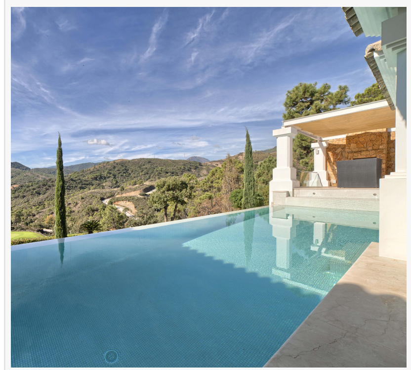
Expansive terraces & direct access to outdoor infinity pool

science of growing a business in the areas of impact, innovation, growth, leadership, and business valuation; and has contributed more than 200 homes to-date as part of its Key for Key<sup>®</sup> giving program in partnership with Giveback Homes™, which guarantees that for every property