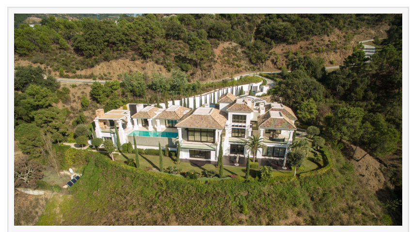
Located in exclusive La Zagaleta Country Club

NEW YORK, NEW YORK, UNITED STATES, February 22, 2021 /EINPresswire.com/ -- Elegant luxury is reimagined in this stunning contemporary Mediterranean villa located within the exclusive Zagaleta Country Club. Villa la Zagaleta will auction online in April via Concierge