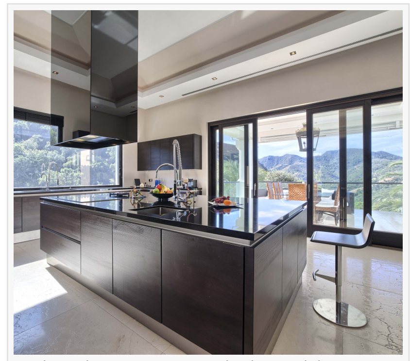
Bright and spacious SieMatic kitchen with luxury finishes

Zagaleta is an exclusive residential development and country club, nestled between rolling Spanish mountain ranges and the cerulean Alboran Sea. The region enjoys 320 sunny days per year, with warm dry summers and mild bright winters that are perfect for exploring Marbella's 30km of beaches. Zagaleta itself offers Country Club living at its finest. Comprising 900 hectares of valleys and wooded groves, enjoy two private verdant golf courses, two elegant clubhouses, tennis club, and a first-class luxury equine facility just beyond your front door. Step on to a yacht for sea access to Puerto Banus or Cabopino Marina, or drift along the Costa del Sol coastline. Access in and out by air is quick and easy with a 30 minute drive to Malaga Airport, or 35 minutes to Gibraltar Airport.