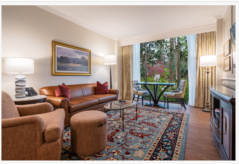
From high-end fixtures and finishes to custom throw pillows and curtains, design and color details found throughout the light-filled spaces provide the ultimate luxury stay guests expect.

Guest room enhancements provide a light-filled, home-away-from-home feeling with wood floor entries, softclose, mirrored closet doors, additional soundproofing, and advanced flooring technology, which offers a warmer and quieter in-room experience. Bathroom square footage has been expanded and features wood flooring, brushed nickel fixtures, modern in-mirror lighting, wood and marble vanities, and marble walk-in showers with soaker shower heads. A historic illustrated map drawn by Hopkins & Motter in 1912 to promote "Houston - A Modern City" hangs above each custom-made