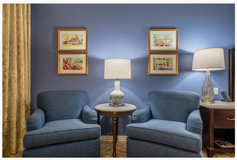
Adding to the memorable ambiance, guest rooms feature custom artwork celebrating the nature found at The Houstonian's scenic 27-acre wooded property.

guest room coffee bar stocked with a Keurig gourmet coffee maker, a mini-fridge, and generous shelving for storage of sundry items. Guests will also want to snuggle up with new luxurious microfiber robes lined with terry velour, as well as all-new cool gel-top Serta Platinum Perfect Sleeper™ mattresses with crisp 60/40 cotton/modal sheeting — a more breathable and moisture-wicking blend to promote a better night's sleep.