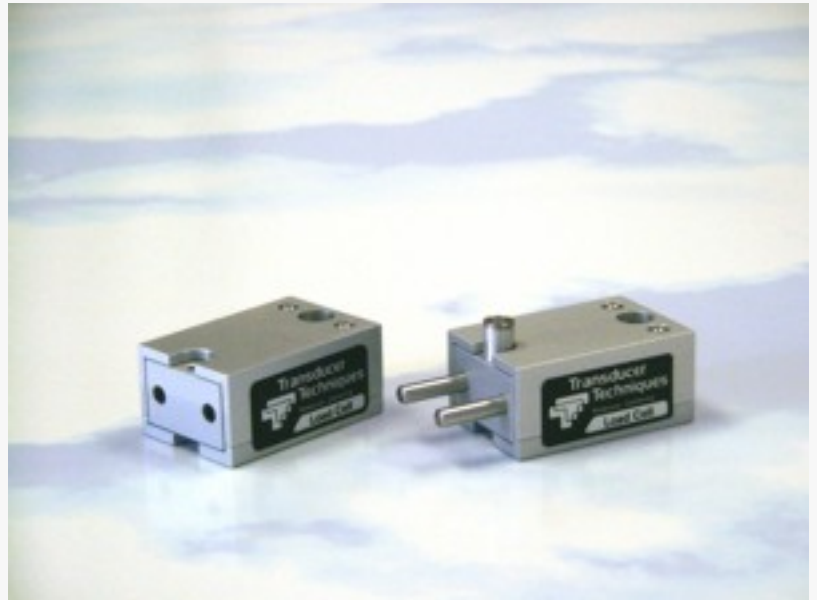
GSO Series Precision Gram Load Cell