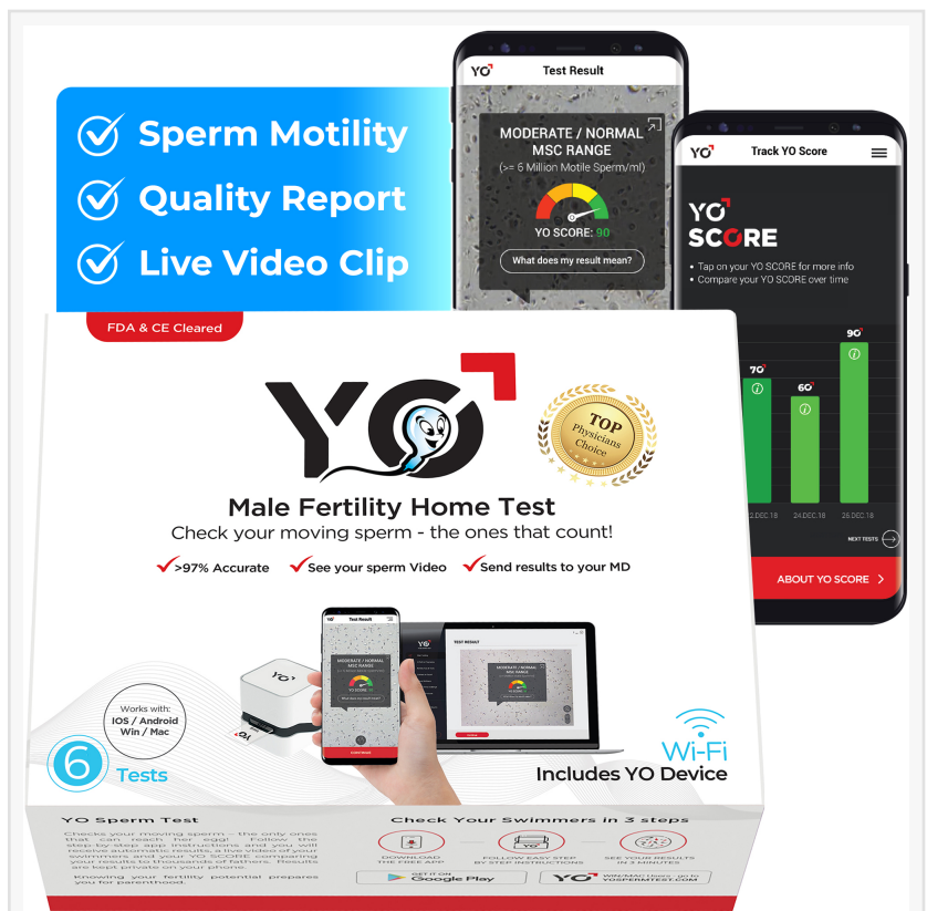
YO 2.0 WiFi Home Sperm Test Kit.

sperm motility is a critical factor in determining and improving male fertility. At a consumer-accessible price point of $79.95, the YO Home Sperm Test Kit includes a 50-use YO device and two YO fertility test packs. YO reports your motility results, provides a live sample video and a YO SCORE ranking that rates your Motile Sperm Quality compared to other men who have fathered a child. Unlike a visit to the Lab or pricey Mail-In alternatives, YO facilitates 100% private and truly remote home-based healthcare. The new Path to Pregnancy App takes things a step further with next-step recommendations based on your results.