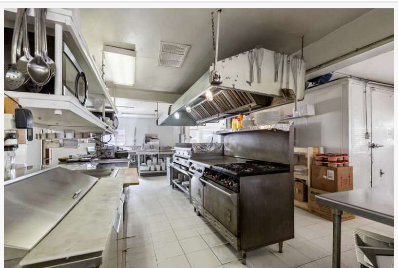
601 W. Main Street, Red River, NM