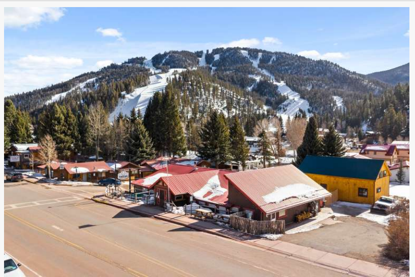
601 W. Main Street, Red River, NM