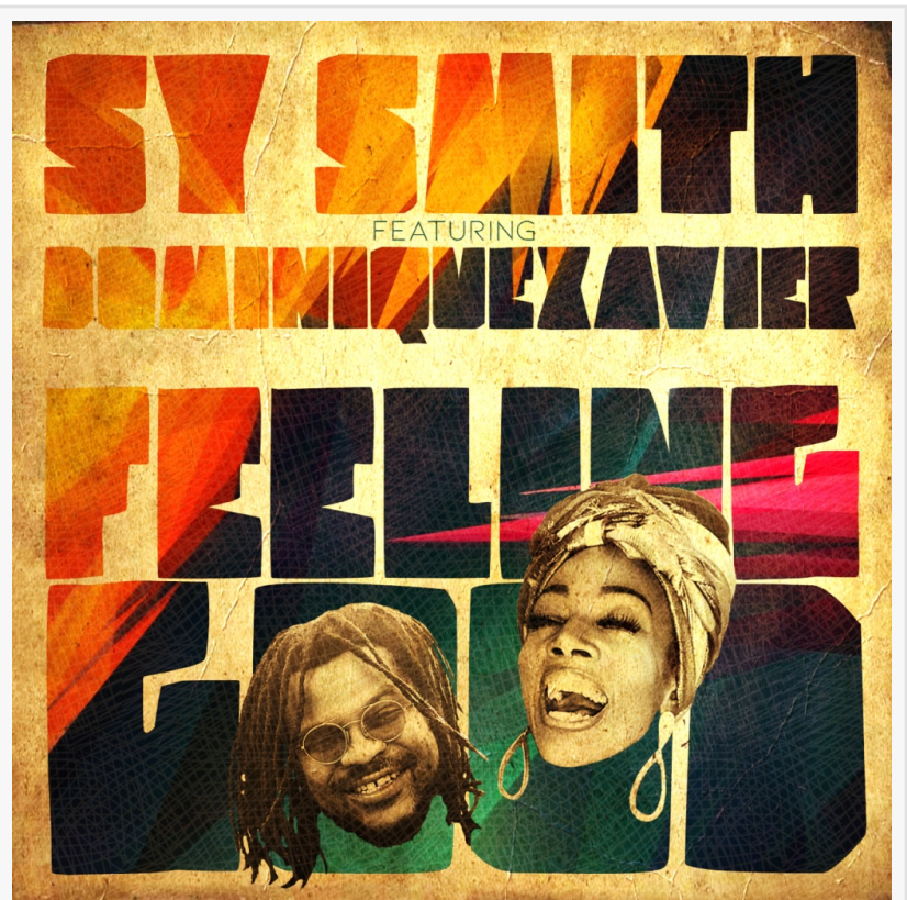
Sy Smith ft. DominiqueXavier - Feeling Good

the Afrofuturistic "Sy Boogie" goddess who's seen blowing the bubbles and ushering those characteristics of empowerment into the world for anyone who needs to catch them. The encouraging bubbles never cease; in fact, the last one to float across the screen states "freedom," the release you feel when you're "Feeling Good."