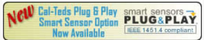
CAL-TEDS Plug & Play Smart Sensors Icon