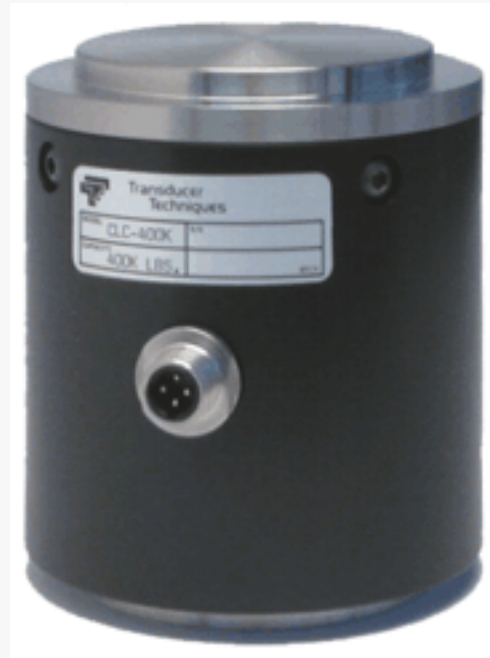
CLC Series Column Load Cell