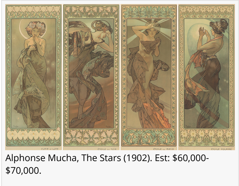
Alphonse Mucha, The Stars (1902). Est: $60,000-$70,000.

NEW YORK CITY, NY, UNITED STATES, February 23, 2021 /EINPresswire.com/ -- The 83rd Rare Posters Auction from Poster Auctions International slated for Sunday, March 14th features masterpieces and rarities from a century of poster design. Top artists include Cappiello , Cassandre , Mucha , and Toulouse-Lautrec.