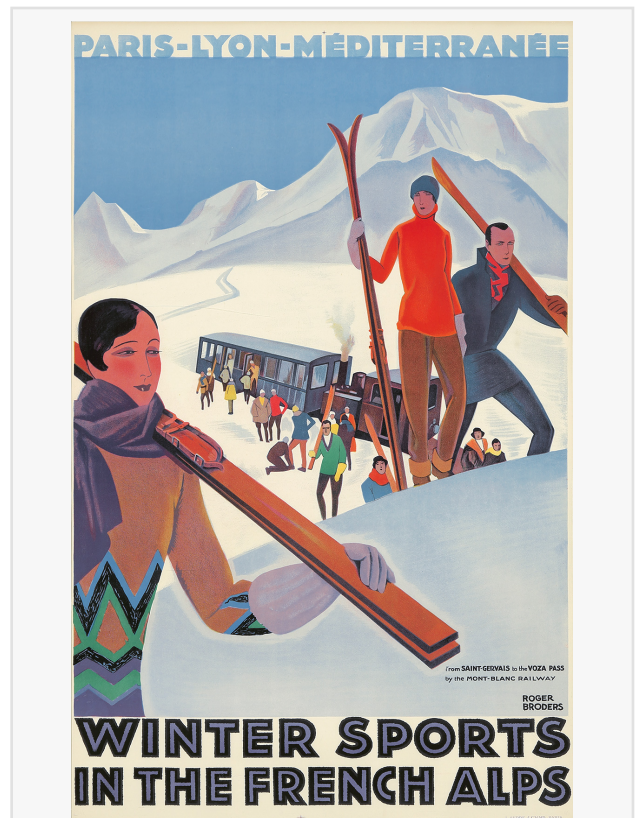
Roger Broders, Winter Sports in the French Alps (circa 1929). Est: $5,000-$6,000.

A number of choice images from Swiss and German artists will come up for bidding. Highlights include Eduardo Garcia Benito's 1929 Candee (est. $4,000-