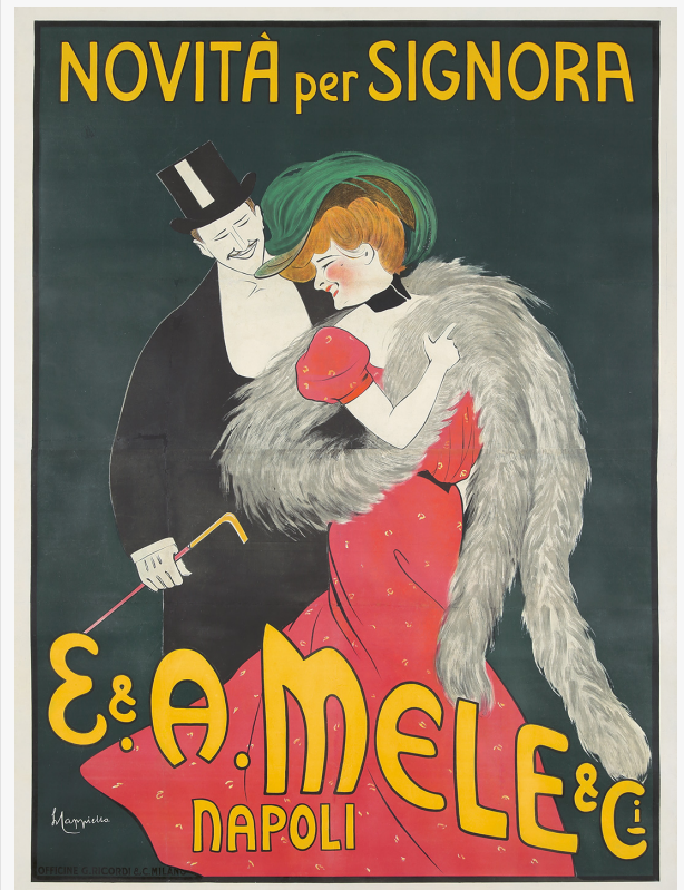
Leonetto Cappiello, Mele / Novità per Signora (1903). Est: $8,000-$10,000.