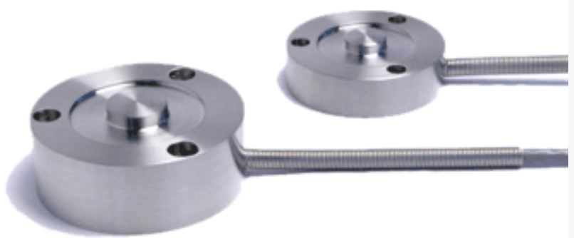
LBC Series Load Cell