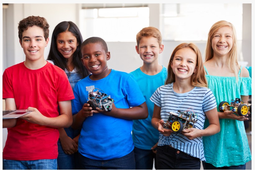
Australian EdTech STEM Punks expands into USA schools

The 'STEM Sisters' Project provides a pathway for girls in High Schools to gain new STEM Skills and explore future careers in STEM, Innovation, Entrepreneurship, and Leadership. STEM Punks also supports the LING Project in Africa which works as a not-for-profit to build digital literacy for girls and help schools and communities to access the tools, training, and support they need to be more effective.