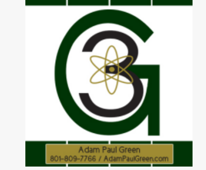
.g3-development.co | Voted Best Utah SEO Agency, Draper 84020

look up information in the Yellow Pages. Today, people turn to 'search engines' to find what they want or need. Each day, on average, Google searches currently total over 400,000,000. When people are looking to purchase something they want/need, more-and-more they're going "on line" to find out what other people think or say about a certain product, service or brand.