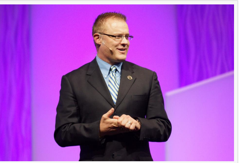
'Best of State' Website Design & Top Reviewed Blog Article Writer

When people needed or wanted something in the old days; they would