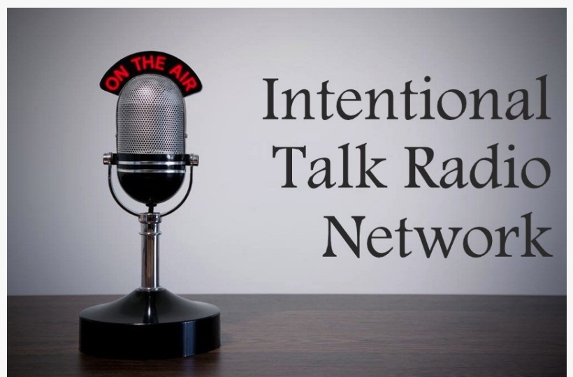
Intentional Talk Radio Network - www.itrnradio.com

About Intentional Talk Radio Network - "We Bring You News and Views that You Can Use"