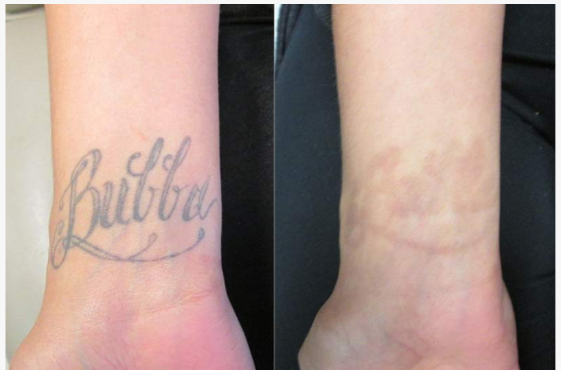
Just great results during research

These cells carry some of the ink to the