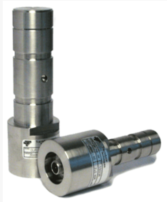
CLP Series Load Pin Load Cell