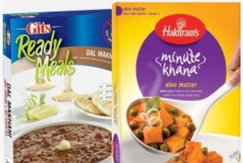
Ready To Eat

This great offer allows you to add more value to your shopping experience by availing huge discounts. For example, when you purchase two packets of Afshan Henna Powder , you would get 10% off on the online retail price of the second packet. Similarly, the attribute applies to assorted vegetarian Samosas – purchasing a couple of packets of Samosas (each packet having 60 units) would get you a 15% off on the second packet.