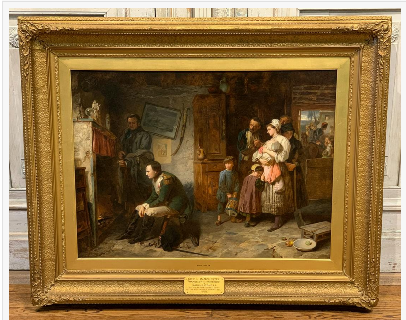
Museum-quality oil on canvas painting by the British Royal Academy artist Marcus Stone (1840-1921), cleaned and restored and in a 50 inch by 40 ¾ inch frame (est. $45,000-$55,000).