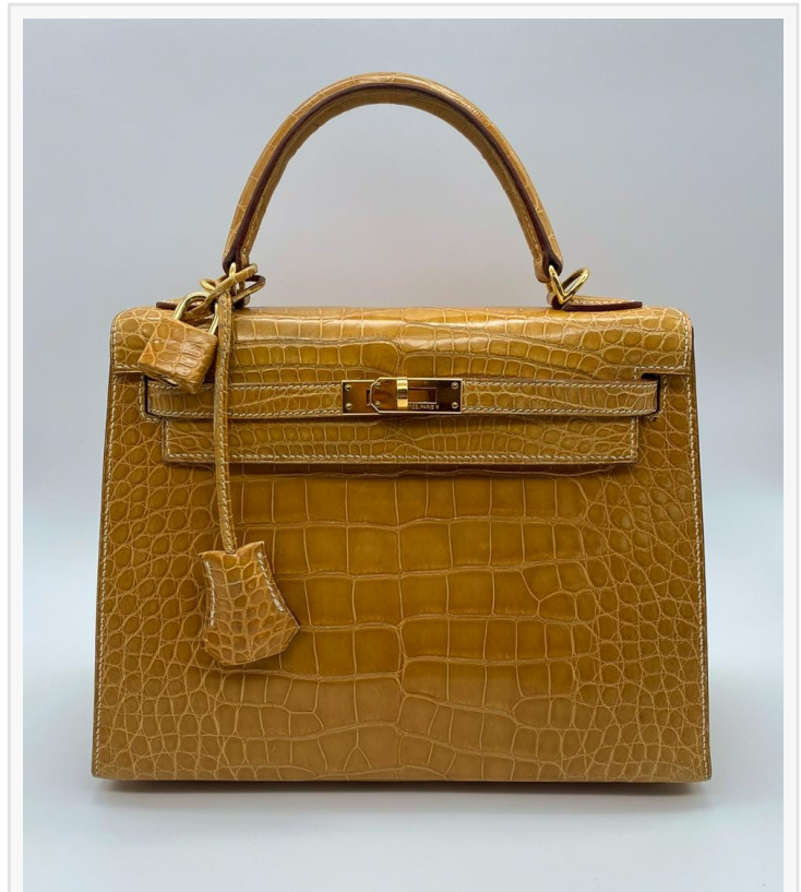
Hermes Kelly Mini 25 alligator bag in a very rare discontinued style and certainly a collector's item, produced in 2000 and in very good condition (est. $55,000-$65,000).

J. Garrett will also offer rare Hermes Kelly bags, an exceptional set of Louis Vuitton luggage in red Epi leather, vintage Chanel and many other couture pieces from a private Texas collection. A private collection of 18th and 19th century antiques and art will also be sold, including fabulous Baccarat, Old Sheffield silver, Royal Academy oil paintings and finely cast bronze chandeliers.