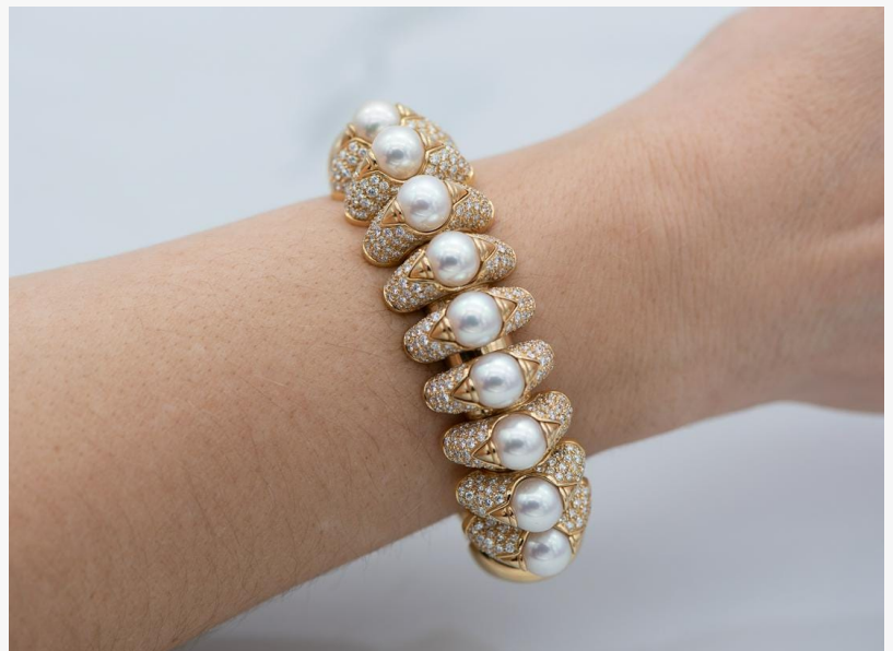
Bvlgari 18kt diamond and pearl Celtaura bracelet inspired by the jewels of the ancient Celts, having 10 carats of diamonds and 9 8.5mm white pearls (est. $32,000-$35,000).