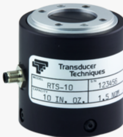
RTS Series Reaction Torque Sensor