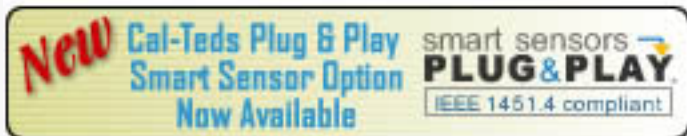
CAL-TEDS Plug & Play Smart Sensors Icon

Transducer Techniques, established in 1979, designs and manufactures a complete line of load cells, torque sensors, special purpose transducers and related instrumentation. Transducer Techniques load cells are uniquely designed for weight and force measurement in such diversified applications as process control and factory automation. Other applications exist in numerous fields of science and industry for