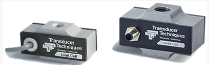
MLP Series Load Cell