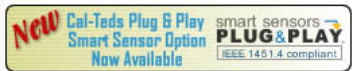
CAL-TEDS Plug & Play Smart Sensors Icon

Transducer Techniques, established in 1979, designs and manufactures a complete line of load cells, torque sensors, special purpose transducers and related instrumentation. Transducer Techniques load cells are uniquely designed for weight and force measurement in such diversified applications as process control and factory automation. Other applications exist in