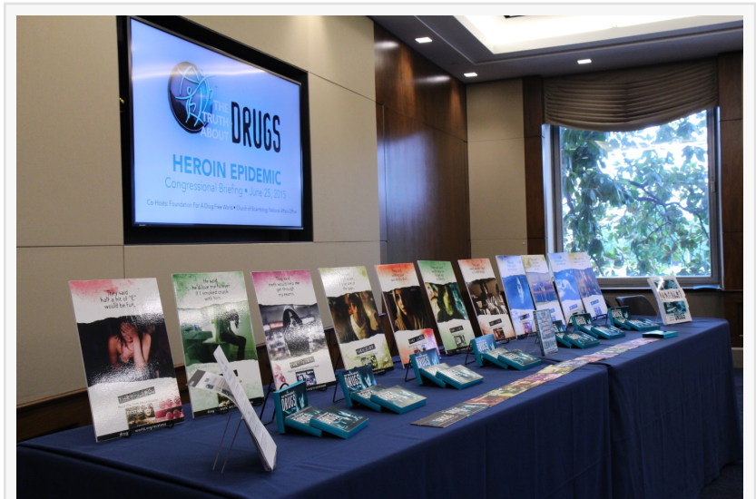
Foundation for a Drug-Free World's Truth About Drugs program mini posters, booklets, DVDs and Educator's kit

The Foundation for a Drug-Free World is an international nonprofit public benefit corporation that empowers youth and adults with factual information about drugs so they can make informed decisions and live drug-free. For more information, please see www.drugfreeworld.org .