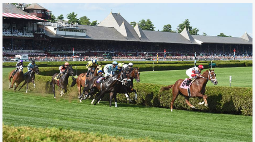
Saratoga Race Course

According to racing industry data from Equibase and the New York Racing Association (NYRA), nearly a dozen horses have died at New York tracks at Belmont Park, Aqueduct in Queens, and Monticello in 2021. As horse racing continues amidst the COVID-19 pandemic, the reported deaths in New York follow a report from the Associated Press highlighting a similar number of horse racing-related deaths in California , an investigative report that revealed 113 deaths in Florida from 2019-2021 from the South Florida Sun-Sentinel, and the Associated Press' report of numerous deaths at Charles Town Race Course in West Virginia.