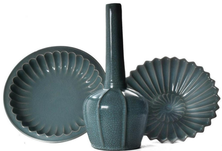
Collection of three Chinese celadon porcelain vessels, including two bowls with ribbed decoration and a distinctive, long-neck vase. Pale blue color. Estimate: £300-£500