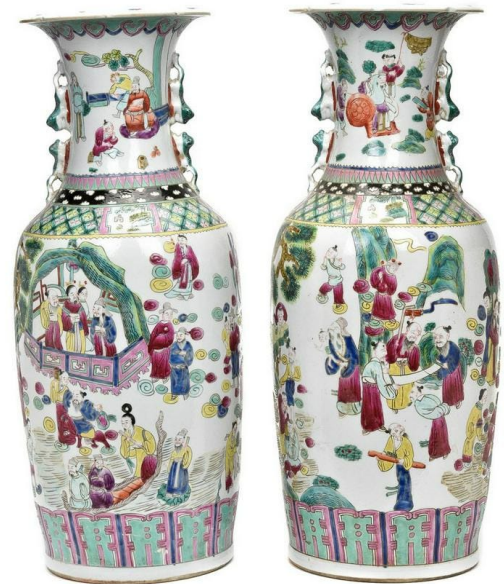
Pair of large Chinese porcelain vases decorated with elaborate scenes and calligraphy. Each 600mm high x 250mm wide. Estimate: £600-£900

Chinese vases are admired for their graceful symmetry and hand-painted detail work. Several exceptional examples are entered in the auction, and like many items from other categories, they come from estate collections in the United Kingdom or Continental Europe, or in some