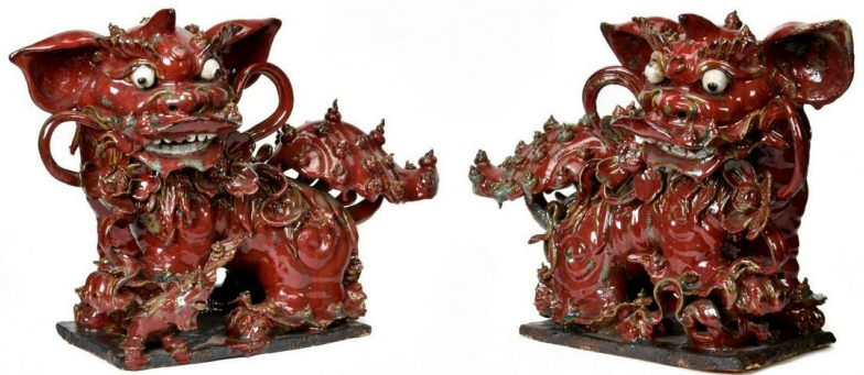
Pair of large, finely modeled Chinese iron-red porcelain 'foo dog dragons,' 450mm high x 600mm wide. Used in feng shui as powerful symbols of protection. Estimate for the pair: £600-£900