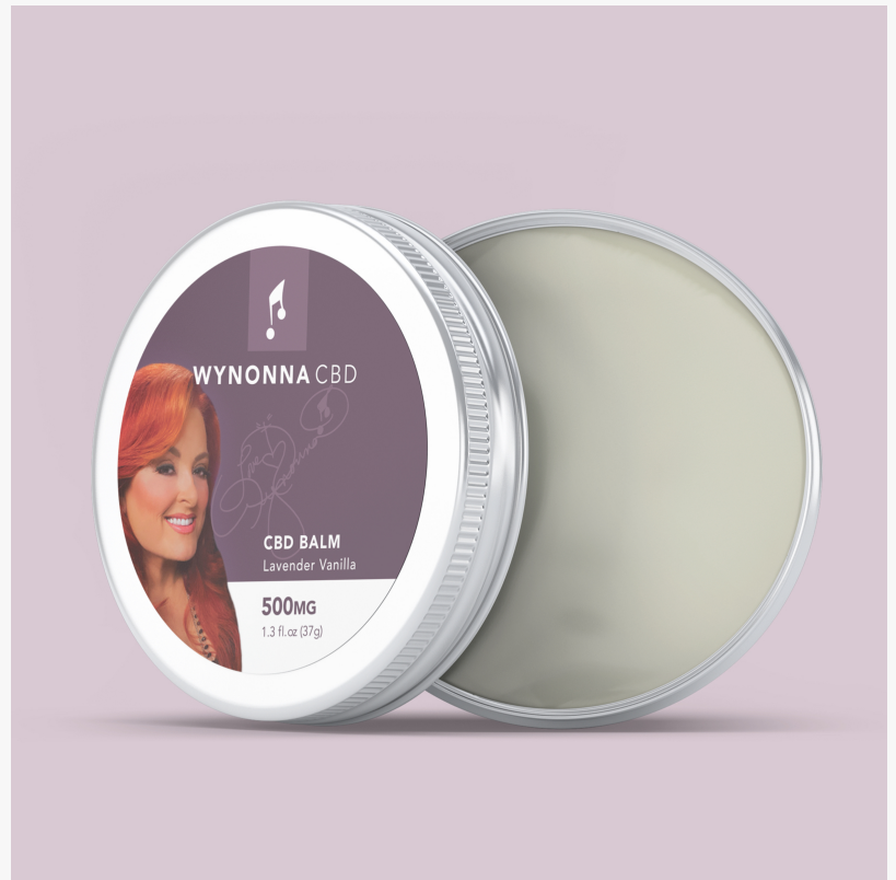
WYNONNA CBD Balm