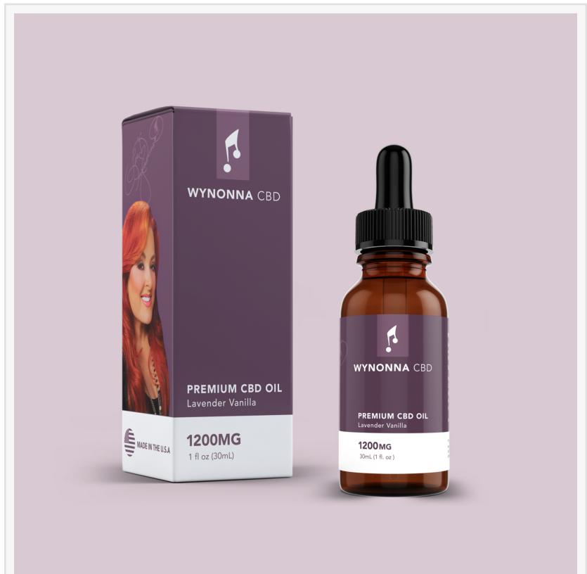
WYNONNA CBD Oil

About Wynonna Judd: Five-time Grammy winner and New York Times best-selling author, Wynonna has always revolved her career around telling stories. Whether performing alongside her mother as one half of the legendary duo The Judds, or pushing the boundaries on her own mega-successful solo path, Wynonna’s ability to reach the heart of the human spirit through her bold and unflinching honesty, is the entertainer’s true gift. Once dubbed by Rolling Stone as “the greatest female country singer since Patsy Cline,” Wynonna’s rich and commanding voice has sold over 30 million albums worldwide spanning her remarkable 36-year career. Wynonna has received over 60 industry awards, with countless charting singles, including 20 No.1 hits such as “Mama He’s Crazy,” “Why Not me,” and “Grandpa (Tell Me ‘Bout The Good Ole Days).”