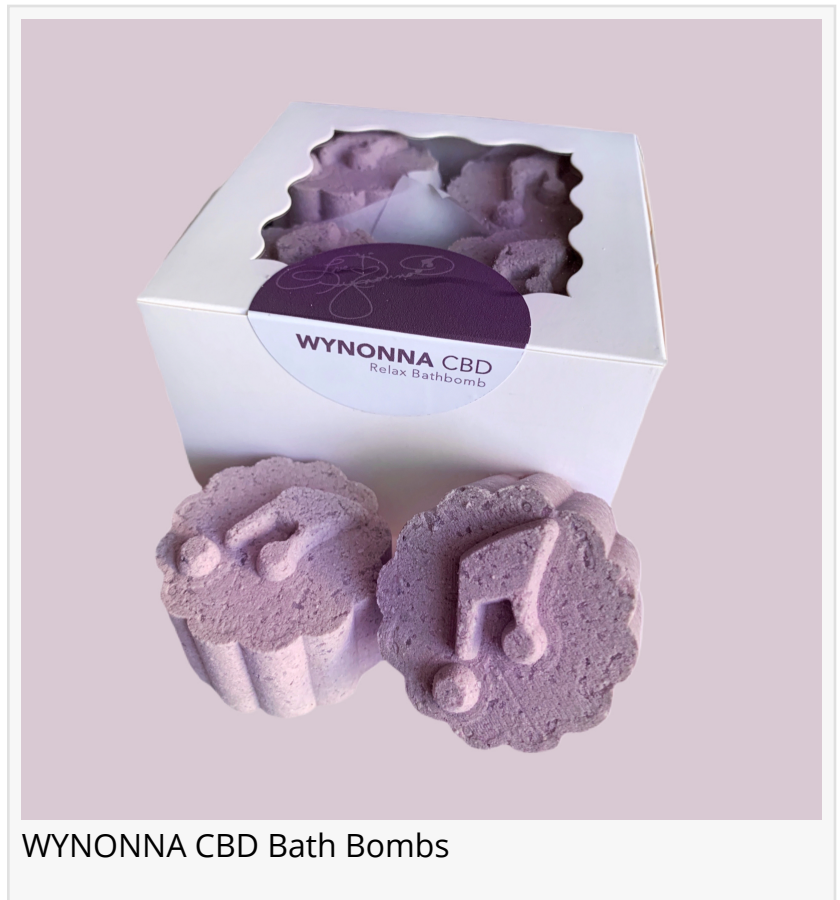
WYNONNA CBD Bath Bombs