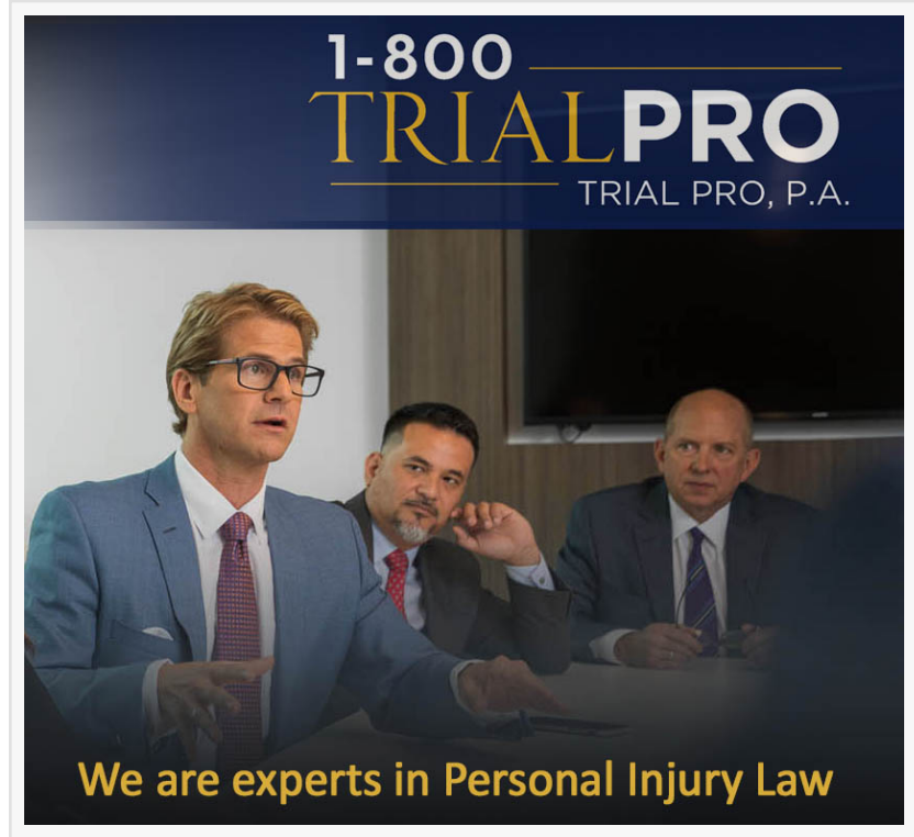
Trial Pro, P.A. Personal Injury Attorneys

The law firm of <u>Trial Pro, P.A.</u> was founded in 2001 in Orlando, Florida. Today, the firm represents individuals who have been injured in personal injury accidents including car accidents, motorcycle accidents, truck accidents, slip and fall accidents, trip and fall accidents, and more from all over Florida.