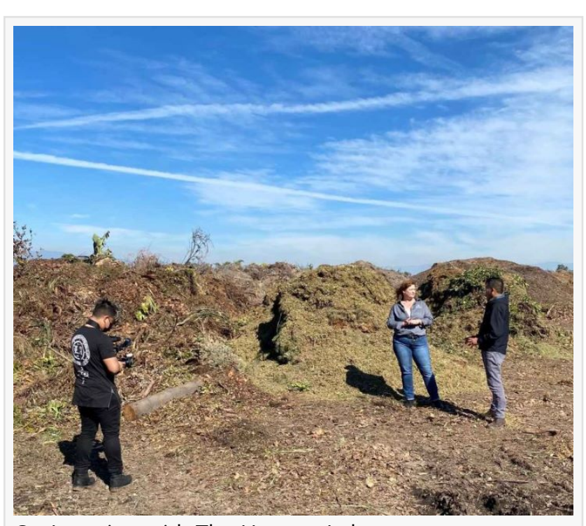
On Location with The Harvest Lab

Harvest Landscape Enterprises, Inc. is pleased to announce the launch of a new YouTube Series called "The Harvest Lab." Each month will feature a new episode on topics that highlight environmental awareness and conservation. The videos will feature