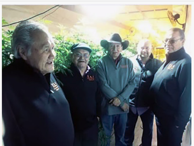
$ZAAG Econic First Nations

Econic, owner of a 15,000 square foot manufacturing facility builds, owns and operates containerized grow pods for the production of cannabis medical products. Foundation Farms business is to build, own, and operate indoor vertical farms for the production of leafy greens and associated food products. The collaborative arrangement will provide opportunities for mutual capital cost savings in both equipment procurement and assembly labor. Key components of the respective technologies such as LED lighting systems, pumps and controls