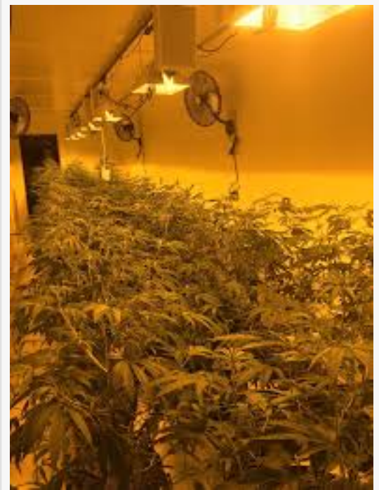
$ZAAG grow 2

□ZAAG Econic Subsidiary has Commenced the Manufacturing and Assembly of the Next 10 Medical Cannabis Grow Pods