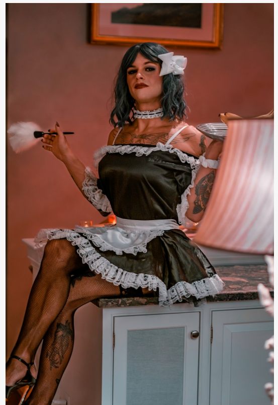
Gloss beauticians will teach you how to pose like a lady.