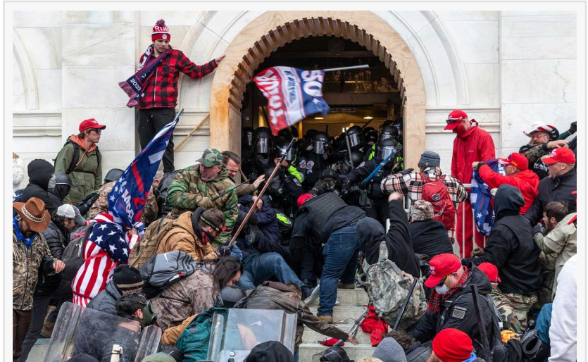
January 6, 2021 - A pro-Trump insurrectionist mob breaks into the Capitol building.