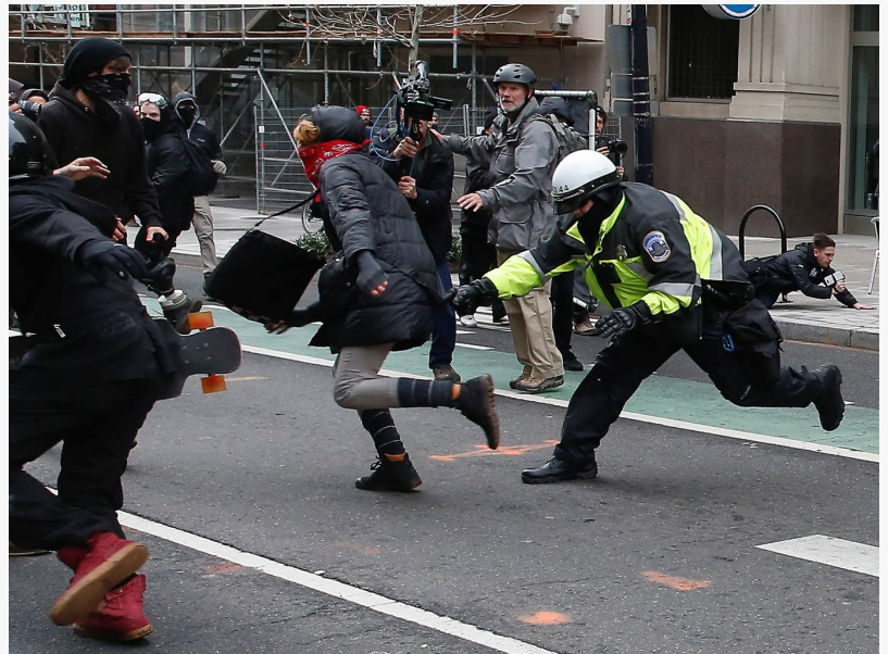
J20 Protests - A police officer tries to tackle a protester demonstrating against U.S. President Donald Trump