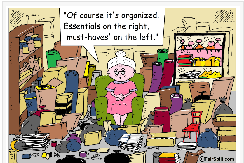
Hoarding filled room; essentials on left and must haves on right.

So, while the big image libraries will have their place, at least now there is a royalty-free resource,