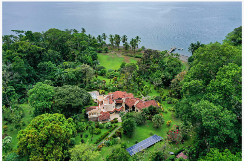
Surrounded by rare wildlife and breathtaking nature, Punta Encanto is a truly private Costa Rican escape.