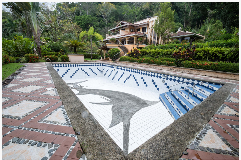
Stroll along the sandy beach, or lounge by the expansive pool.