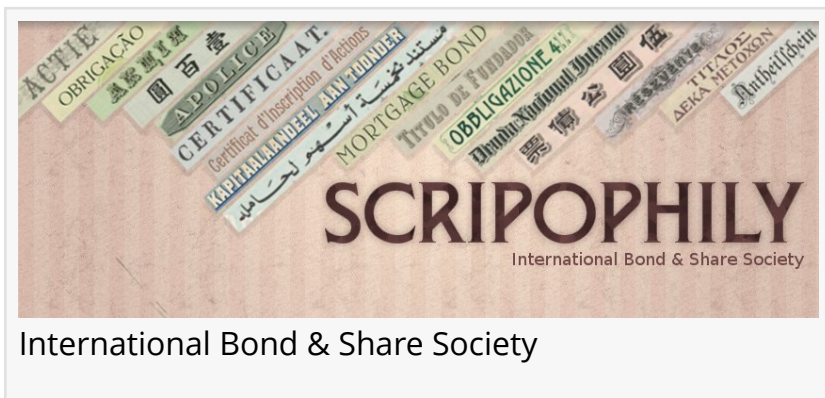
International Bond & Share Society

A part of scripophily is the area of financial history. Over the years there have been millions of companies which needed to raise money for their business. In order to do so, the founders of