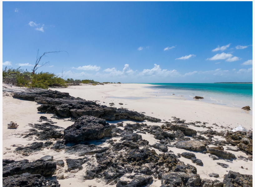
One of the largest private islands in the Bahamas at 730ac