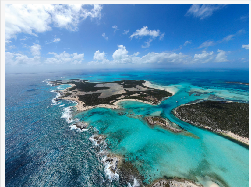
Stunning private island in southern Bahamas

Little Ragged Island accurately represents nature at its most undisturbed. It sits at the southernmost end of the Ragged Island chain, a 100-mile string of islets that beg to be explored. Quiet and serene, Little Ragged Island presents a haven for avid fishermen with unparalleled flats. Vivid reefs and warm waters dot the island’s sandy beachfront. Sailing and snorkeling are favored local activities, or watch for wild pink flamingos in the shallow water off the beaches along the chain. Access from Long Island in the Bahamas is quick and easy via boat ride or charter flight to Duncan Town Airport.