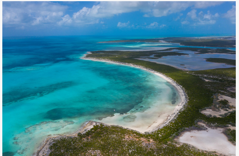
Miles of pristine sandy beaches and warm, quiet waters