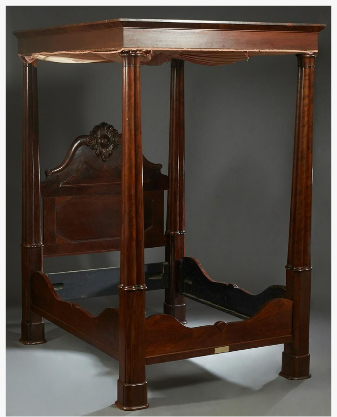
Beautiful 19th century New Orleans carved rosewood full tester bed, probably made by Prudent Mallard, 110 inches tall and 58 \frac{3}{4} inches deep (est. $3,000-$5,000).

Sully Hildebrand Crescent City Auction Gallery +1 504-529-5057 email us here