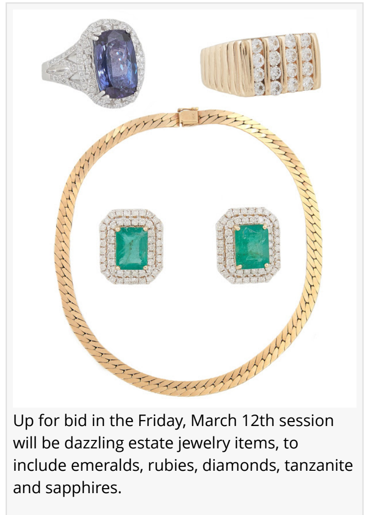
Up for bid in the Friday, March 12th session will be dazzling estate jewelry items, to include emeralds, rubies, diamonds, tanzanite and sapphires.

Original paintings by New Orleans artists is another category bidders have come to expect from