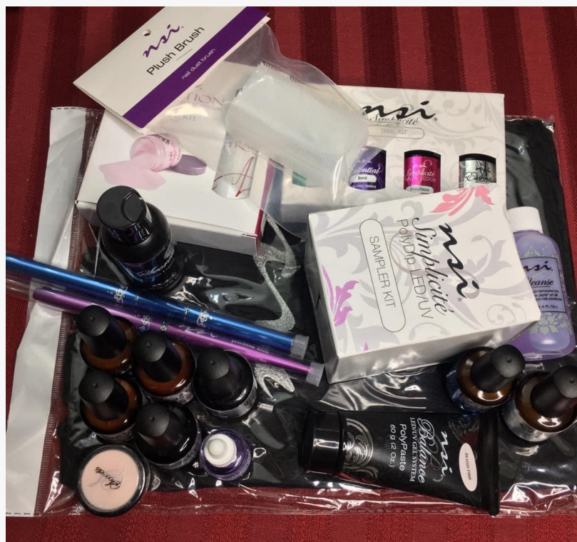
Nail Technician Tools and Products

This press release can be viewed online at: https://www.einpresswire.com/article/536191022