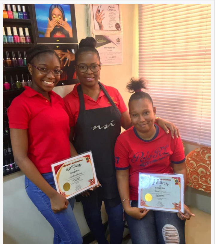
Nail Technician Graduation