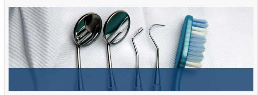
All Valley Dental: Custom DENTURE and BRIDGE Repair

in order to provide quality, oral health care. AVD provides families with the full-array of dental services since they are your local resource for all of your dental needs.