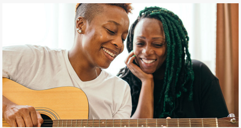
Black woman playing guitar to her female lovers as they chill at home.