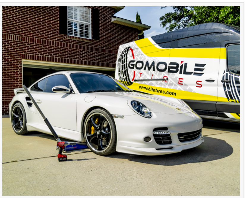
GoMobile Tires - Mobile installation at home, office or on the go!

PORTLAND, OR, UNITED STATES OF AMERICA, March 4, 2021 /EINPresswire.com/ -- <u>GoMobile Tires</u>, the fastest-growing full-service mobile tire service in the nation, accelerates the brand's strategy in 2021 with an expansion into the United Arab Emirates (UAE). GoMobile Tires has developed a world-class business model for mobile tire installation, naturally the efforts will include global franchises. The companies' CEO is looking at a supersonic ramp-up to implement a multi-channel market-