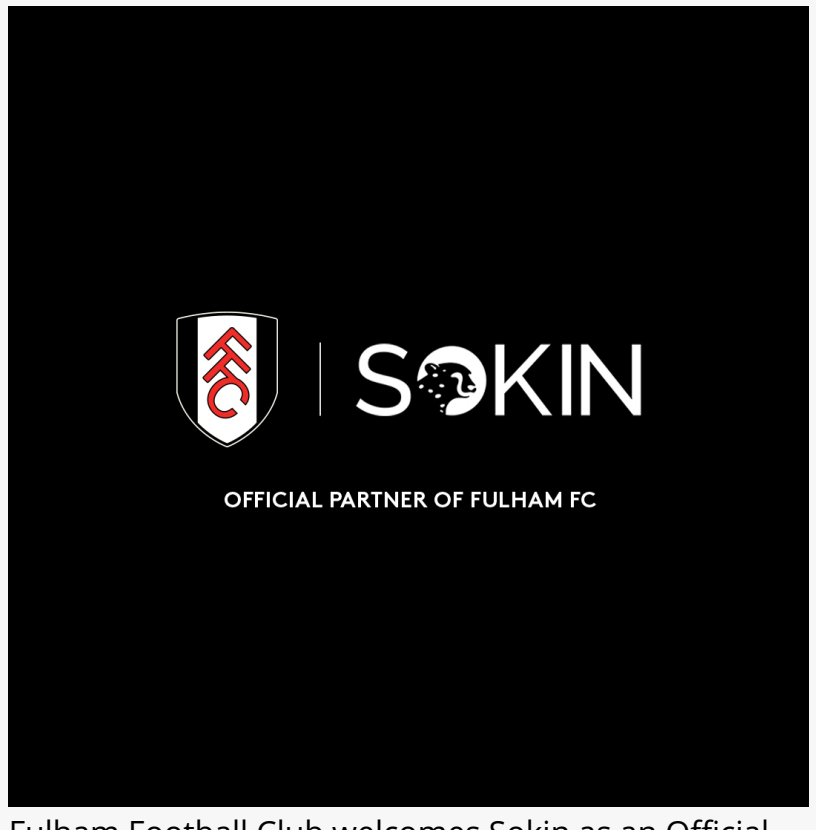
Fulham Football Club welcomes Sokin as an Official Partner

Sokin, a global currency account provider, focuses on creating an open and transparent payments platform for its clients. It is the only payment provider enabling global payments for a fixed monthly fee, giving consumers the power to make unlimited payments and transfers.