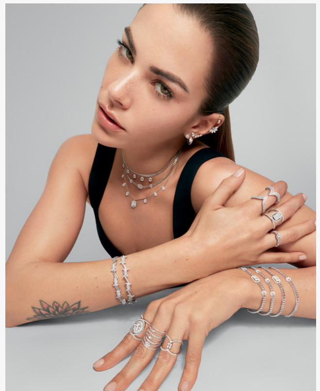
Fashionistas Around the World, Unite!

For any wholesale inquiry, or to become a DJULA