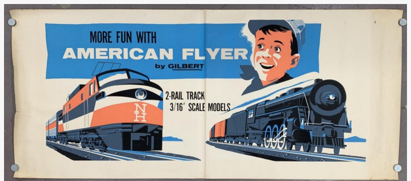
Exceedingly scarce and huge American Flyer dealer poster – 95 inches by 42 inches and made circa 1955 – chromolithographed on two pieces of paper, then factory attached ($5,100).