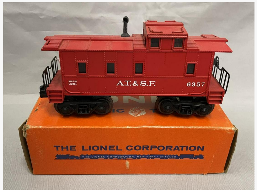
Boxed Lionel 6357-50 Father & Son caboose, one of the harder cabooses to find (and the accompanying box even scarcer), produced only in 1960 for the Father & Son set ($1,650).