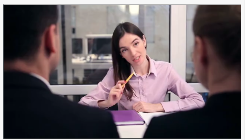
Health insurance agent group health insurance in Fort Worth