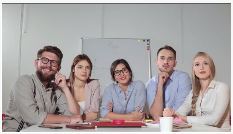
Fort Worth Group Health Insurance

purchasing process and during the utilization of its health insurance policies.