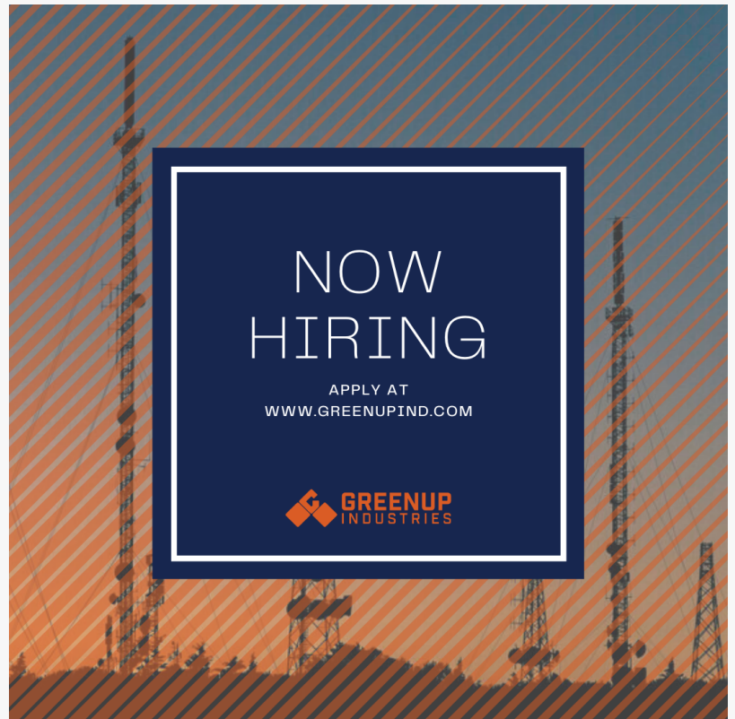
Greenup supports diversity and inclusion in its hiring practices