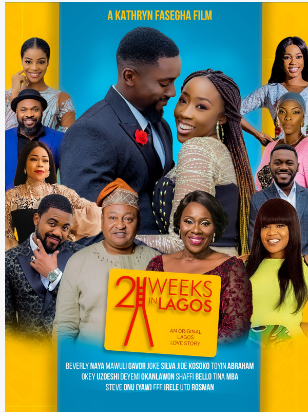
2 WEEKS IN LAGOS Poster