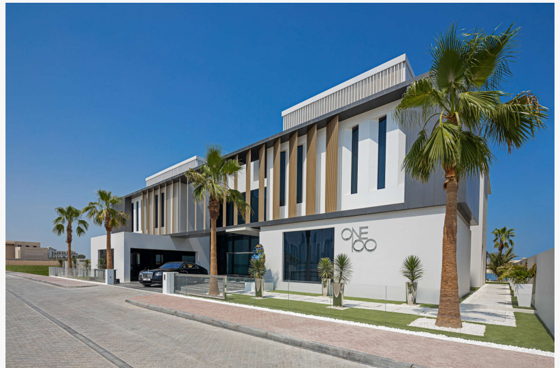
The most expensive villa on Palm Jumeirah

DUBAI, UNITED ARAB EMIRATES, March 9, 2021 /EINPresswire.com/ -- Dubai's leading luxury brokerage, LuxuryProperty.com has sold an amenity-laden mansion on the Palm Jumeirah , Dubai, for a record shattering sum of AED 111,250,000 ($30.3 million). The sale represents the second highest residential sale in Dubai's history and the highest in over six years as another sign of the booming luxury market in Dubai.