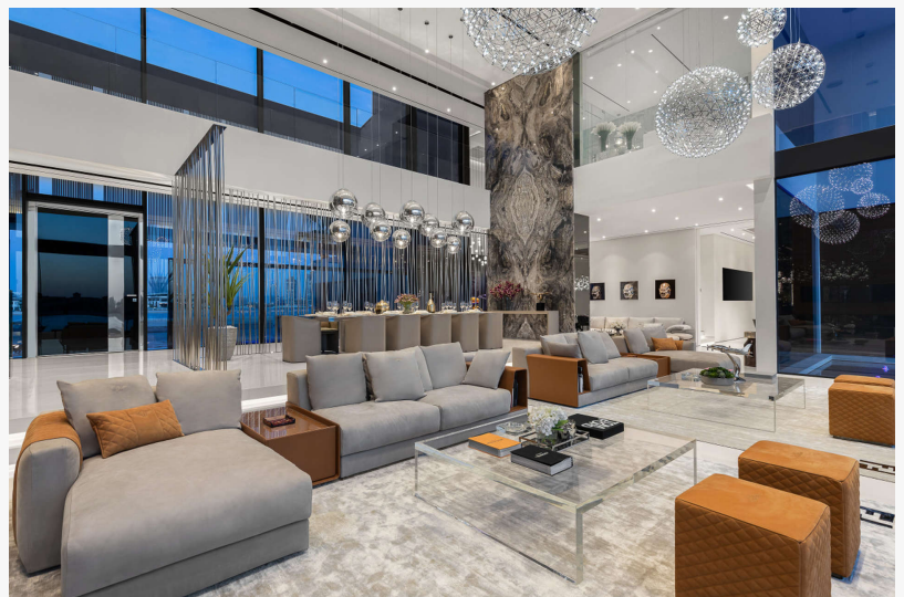
Stunning interiors by Fendi, Bentley, Louis Vuitton and Hermes

A dynamic digital destination, LuxuryProperty.com lists an exclusive portfolio of over $6 billion of on- and off-market properties across the globe. As a brokerage, LuxuryProperty.com specializes