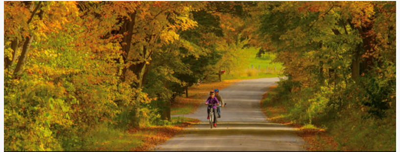
Shelter Valley Road