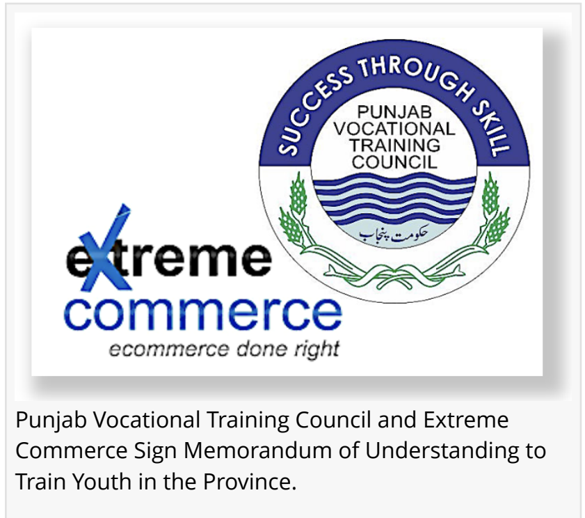
Punjab Vocational Training Council and Extreme Commerce Sign Memorandum of Understanding to Train Youth in the Province.

LAHORE, PUNJAB, PAKISTAN, March 9, 2021 /EINPresswire.com/ -- The Punjab Vocational Training Council and Extreme Commerce have signed a memorandum of understanding to uplift the skill sets of the youth in Punjab. Extreme Commerce's will offer its state-of-the art Video Boot Camp (VBC) for the training and capacity including initiatives, along with boosting the culture of entrepreneurship and E-Commerce.